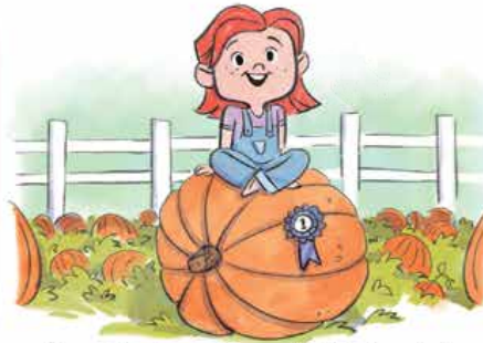
Grow the largest pumpkin in the state.