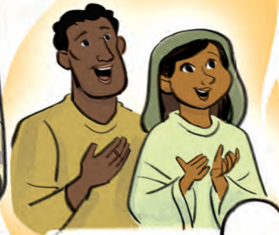
Everyone who believed Peter's message was baptized.