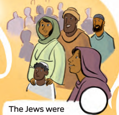
The Jews were amazed to hear the disciples speaking in their own languages.