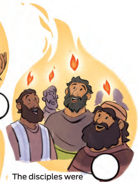
The disciples were filled with the Holy Spirit.