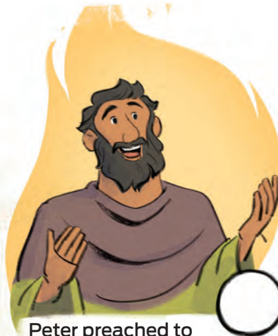
Peter preached to the crowd about Jesus.