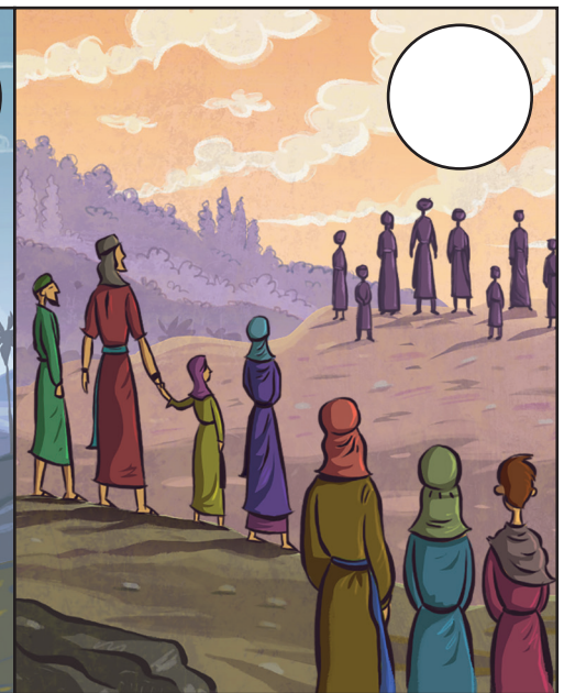
Jacob divided his family into two groups and sent Esau a gift.