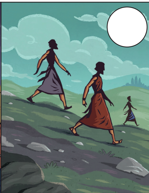
Jacob sent messengers to tell Esau he was coming home.