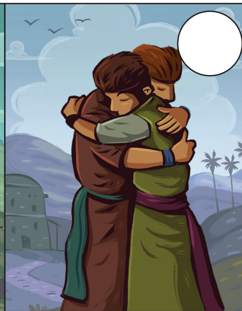
Esau ran to Jacob and hugged him, welcoming him home.