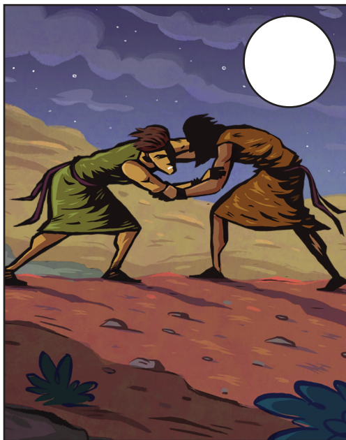
Jacob wrestled with God all night.